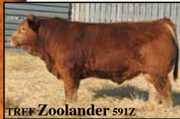
TREF Zoolander 591Z

Your support & confidence truly inspires us, as we begin our 31st year in the Limousin breed.